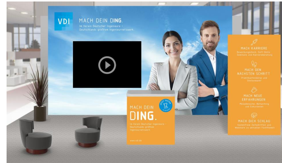
Example of an exhibition stand - VDI