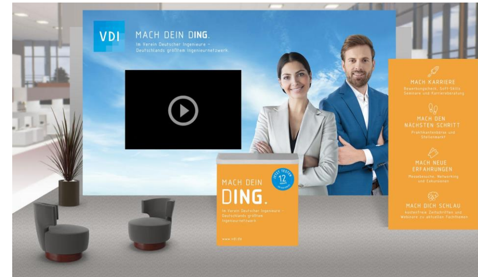
Example of an exhibition stand - VDI