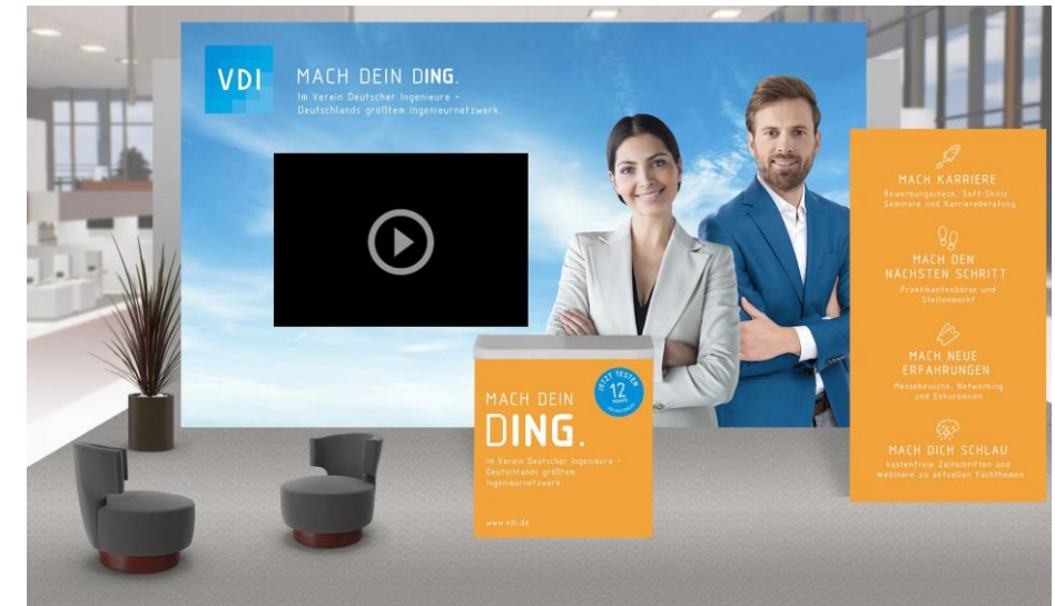
Example of an exhibition stand - VDI